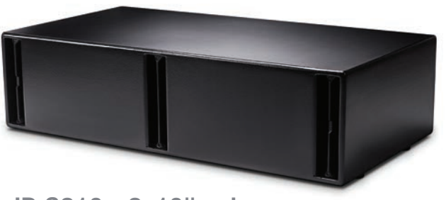
ID S210 - 2x10" sub

Compact and powerful, the 1x10" sub measures just 285mm high x 525mm wide x 550mm deep, offering punchy sub bass performance in the smallest form factor. (ID S110t touring version pictured).