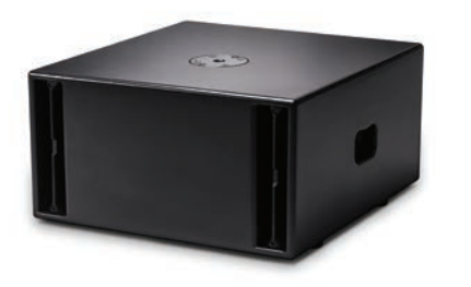
ID S110 - 1x10" sub

Complementing the ID24 speakers are two compact, powerful subs, both available in install and touring versions. With a low-profile, sleek design, ID Series subs are easily installed discretely in a wide range of locations - within walls, staircases, under furniture and more.