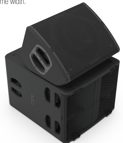
A P12 stacked on top of a L15 offers and extremely compact yet efficient drum fill.

A dedicated minimum latency setup is also available, compatible with the minimum latency monitor setups of the P12. The result is a very efficient drum-fill system, both cabinet sharing the same width.