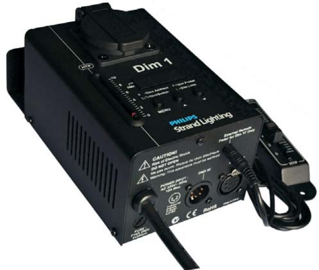
Dim 1 Single Channel Portable Dimmer