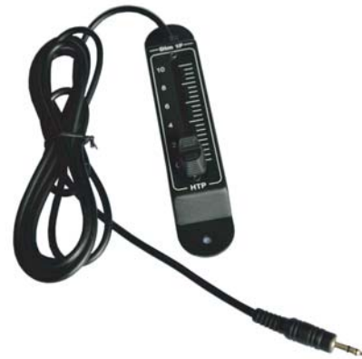
Dim 1 External Remote Single Fader