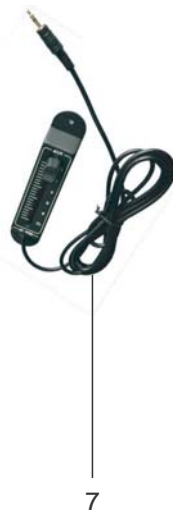
Dim 1 Single Channel Portable Dimmer