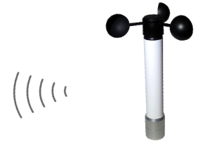
WINDY B/S - wind speed sensor