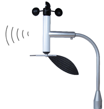
WINDY B/SD - wind speed and direction sensor